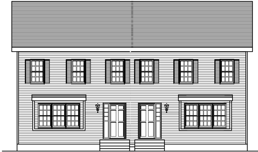
44'x 24'/26' DUPLEX

266 Park Street . North Attleboro, MA 02760 (508)294-3612 . www.packertdesign.com