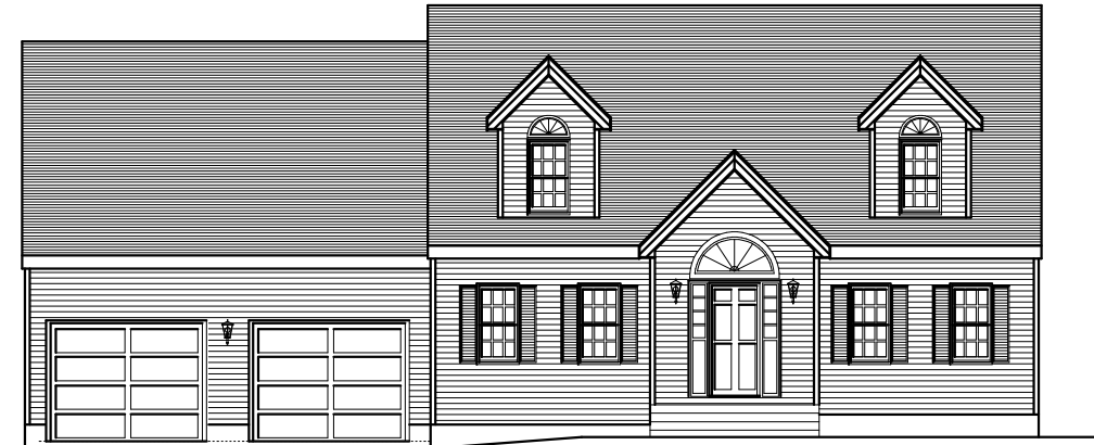
36'0" x 26'0" CAPE

266 Park Street . North Attleboro, MA 02760 (508)294-3612 . www.packertdesign.com