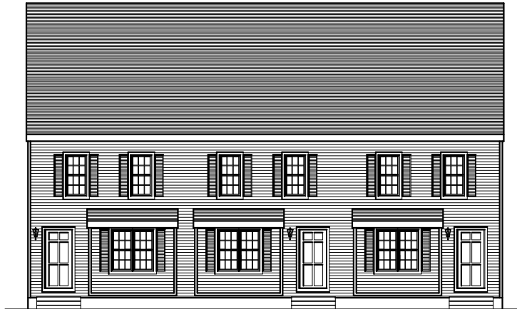
54'-0" x 35'-0" TRIPLEX

266 Park Street . North Attleboro, MA 02760 (508)294-3612 . www.packertdesign.com