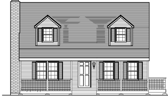
32' x 24' CAPE

266 Park Street . North Attleboro, MA 02760 (508)294-3612 . www.packertdesign.com