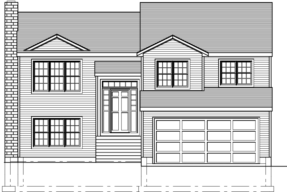
PROPOSED RAISED RANCH

266 Park Street . North Attleboro, MA 02760 (508)294-3612 . www.packertdesign.com