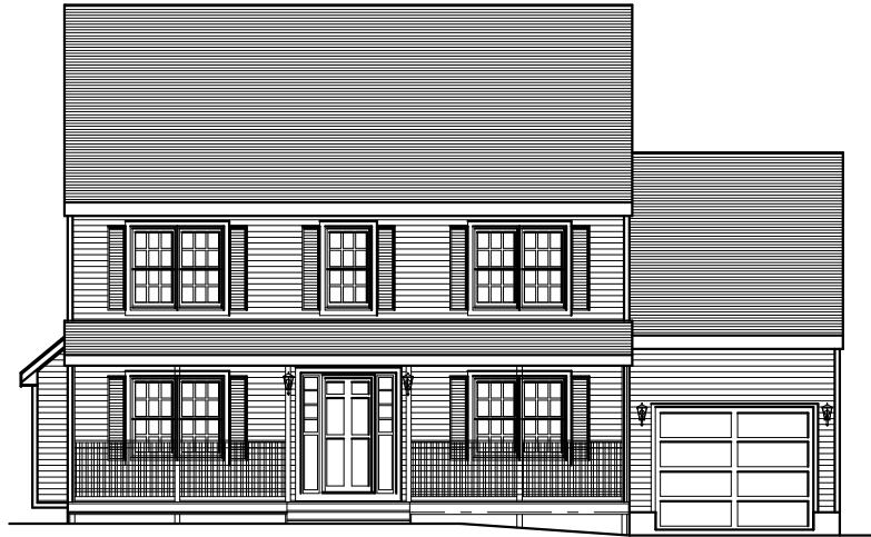
32'-0" x 26'-0" COLONIAL W/ 1 CAR GARAGE

266 Park Street . North Attleboro, MA 02760 (508)294-3612 . www.packertdesign.com