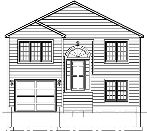
30'0" x 42'0" / 44'0" RAISED RANCH

266 Park Street . North Attleboro, MA 02760 (508)294-3612 . www.packertdesign.com