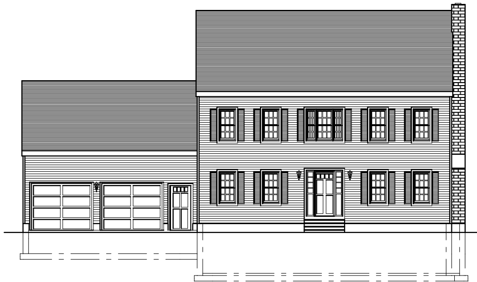
38'-0" x 28'-0" COLONIAL w/ 2 CAR GARAGE

266 Park Street . North Attleboro, MA 02760 (508)294-3612 . www.packertdesign.com