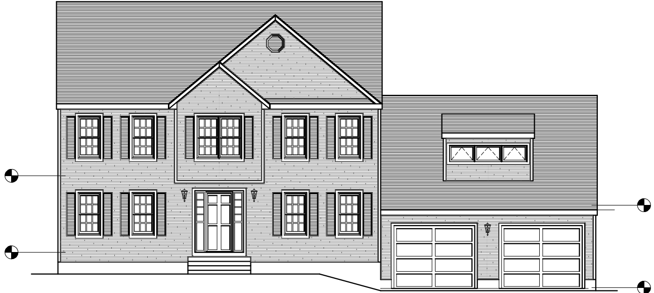
PROPOSED 36' x 26' COLONIAL W/ 2 CAR GARAGE

266 Park Street, North Attleboro, MA 02760 (508)294-3612 . www.packertdesign.com