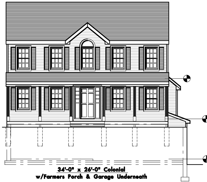
34'-0" x 26'-0" Colonial w/Farmers Porch & Garage Underneath

266 Park Street, North Attleboro, MA 02760 (508)294-3612 · www.packertdesign.com